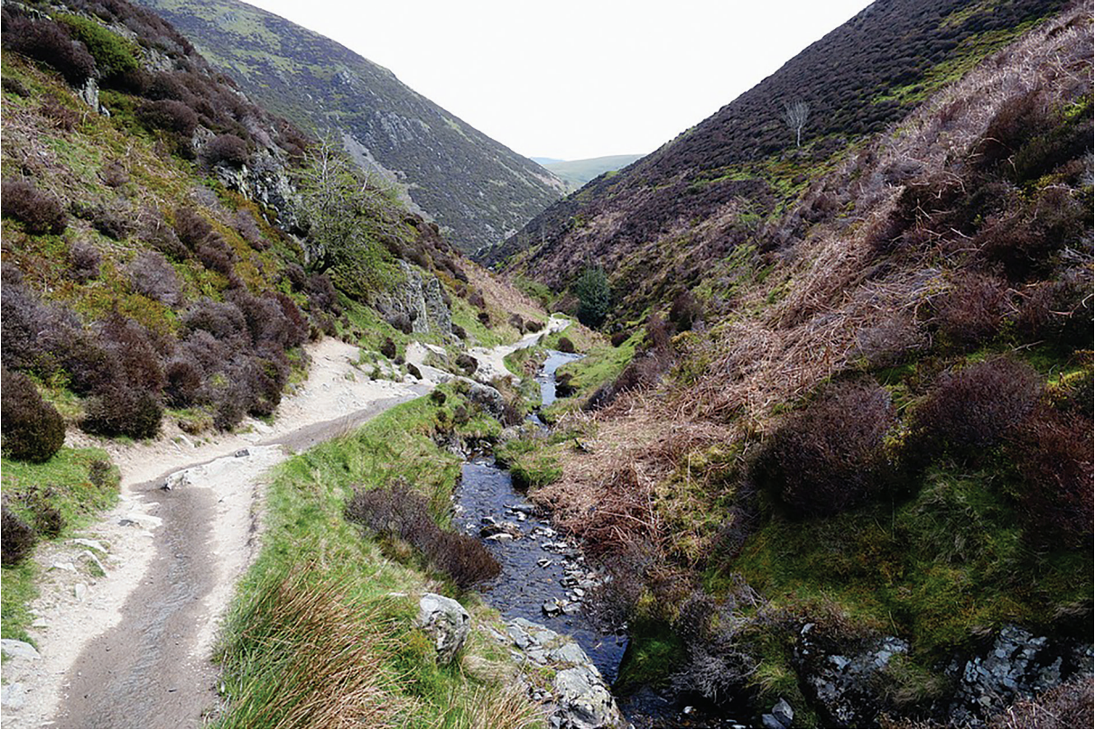
A landscape at Carding Mill, Shropshire