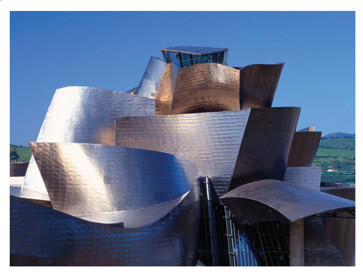
Guggenheim Museum, Bilbao, Spain