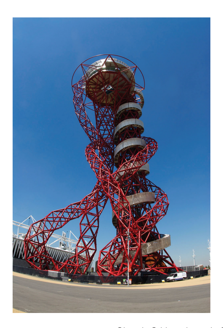
Olympic Orbit sculpture in Olympic Park, Stratford