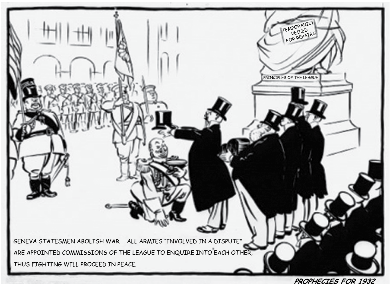
A British cartoon published in December 1931.