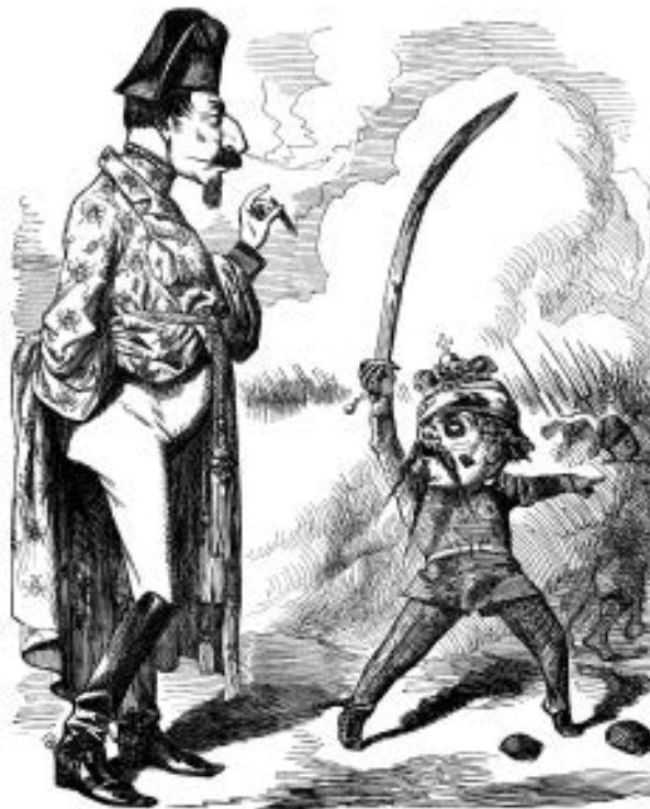
THE GIANT AND THE DWARF.

A cartoon published in Britain in June 1859. Napoleon III, on the left, is saying to King Victor Emmanuel, 'Bravo, my little fellow! You shall do all the fighting and we'll divide the glory.'