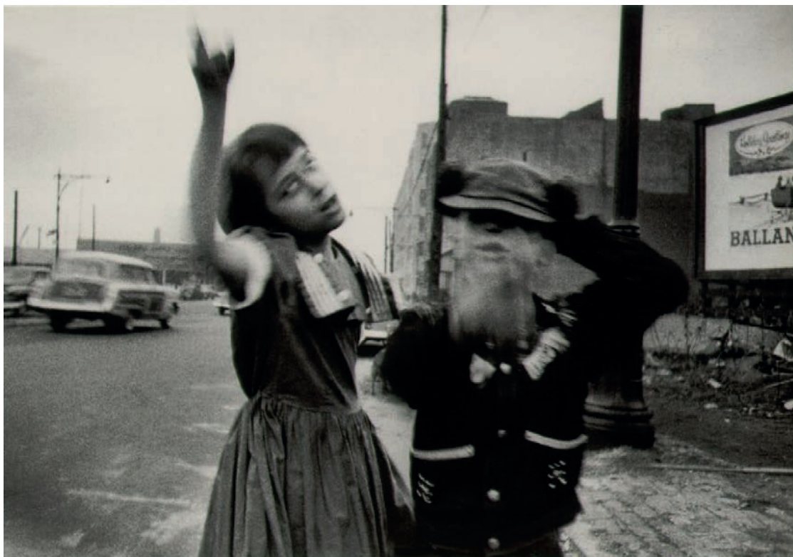
Dance in Brooklyn William Klein photograph

The addition of a mask or simply an awkward pose can also be unsettling, such as in photographs by Eugene Meatyard and Diane Arbus. Arbus's photograph Child with Toy Hand Grenade in Central Park perhaps reflected a wider anxiety in American society at the time of the Vietnam War.