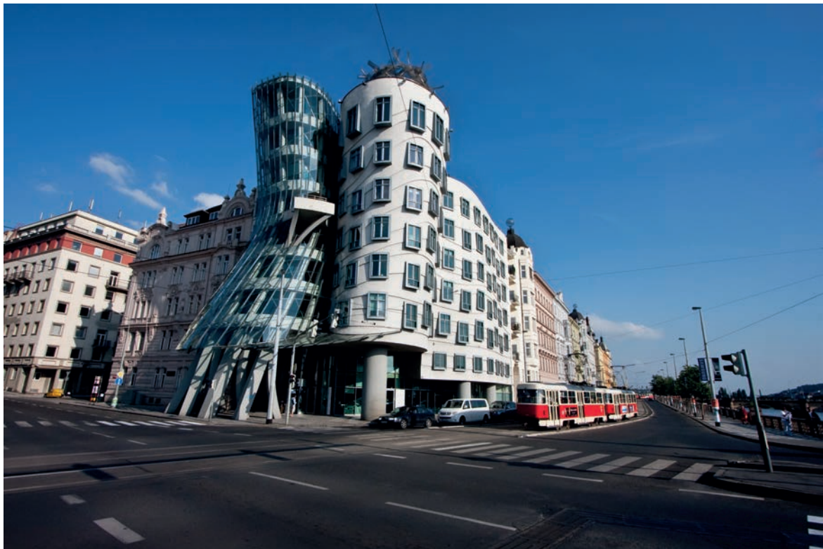
Dancing House Frank Gehry building

The Reichstag Building in Berlin, once a symbol of Nazism and later of Germany divided during the Cold War, has been transformed by Norman Foster. Now, a public viewing gallery with a spiralling glass cupola directs and streams light into the building, symbolising the new openness and freedom of the unified country.