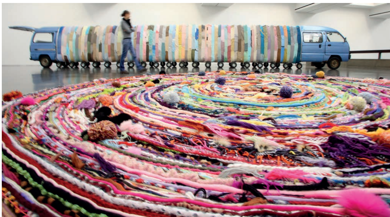
Simple and Light as a Dream Yin Xiuzhen sculpture

Using the urban environment for inspiration can produce some fascinating textile pieces; the soft flexible nature of fabric contrasts strongly with the rigid geometry of concrete and steel. The transformation of the built environment has inspired artists such as Emilie Faif in her free-standing sculpture Paris/New York and also Yin Xiuzhen in her installation Portable Cities . Other pieces such as Rushton Aust's massive wall hangings physically interact with architectural structures.