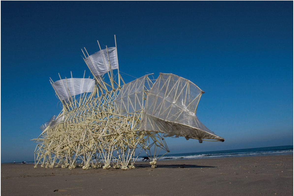
Strandbeest Theo Jansen photograph

Kinetic sculptures are in a perpetual state of transformation and their motion is compelling to the spectator. The power in these works is often driven by natural forces and the mechanisms vary, from simple wind-driven panels to extremely complex gears and pulleys. The mechanical elements often add to the visual aesthetic. Anthony Howe and Theo Jansen create incredibly sophisticated pieces.