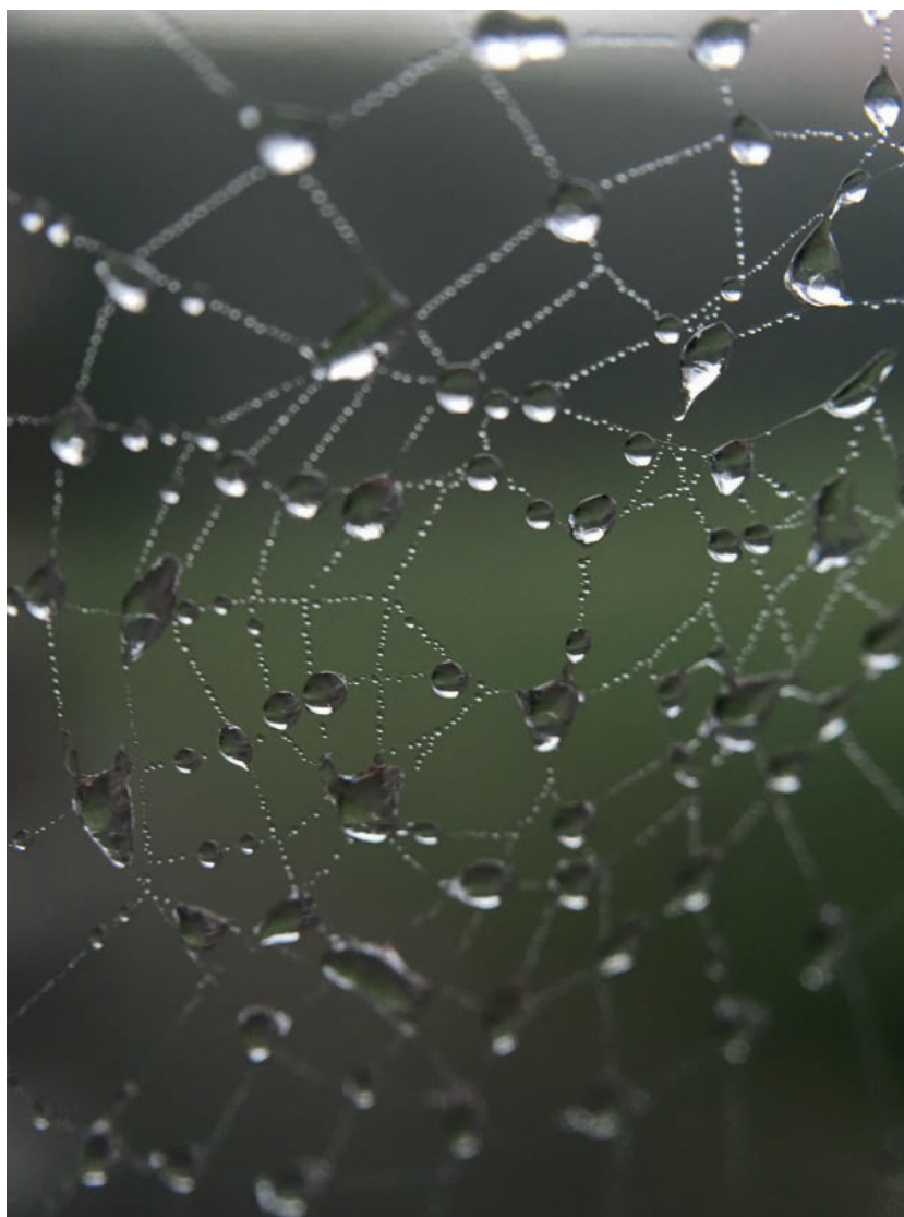
Full Frame Shot of Wet Spider Web

The use of soluble fabric, film and paper has revolutionised embroidery by allowing needlework stitches to exist in three-dimensional space and letting light penetrate from all directions. Stitching becomes the actual structure of the object rather than acting as a decoration. Textiles produced in this way can have the subtlety and delicacy of cobwebs and cocoons, or the density and complexity of bramble hedgerows. Valerie Campbell-Harding and Jan Beaney are two designers who exploit this technique.