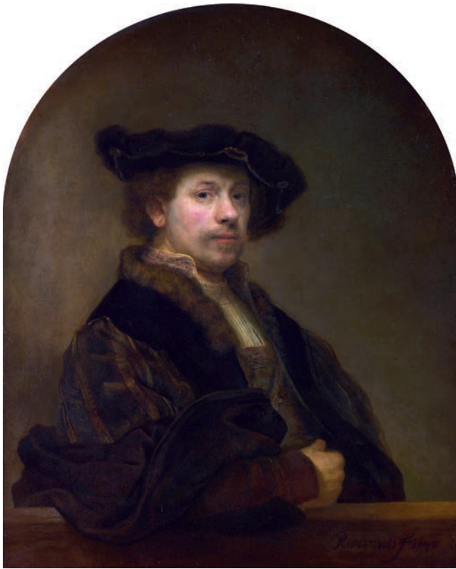
Self-portrait at the age of 34 Rembrandt van Rijn painting