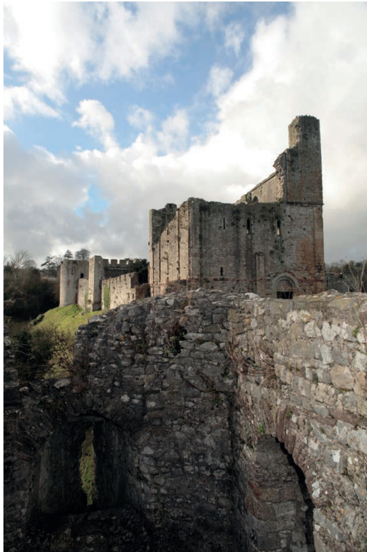
Chepstow Castle

The process of chemical erosion, whether natural or man-made, produces unique colours and surface textures. The effects of mildly acidic rainwater – dissolving limestone, causing iron to rust, and oxidising copper and bronze, have inspired many artists. The decay of once prestigious buildings influenced many paintings of the Romantic Period. Interestingly, etching in printmaking relies on this process to produce unique characteristics. Giovanni Piranesi's etchings documented famous ruins, such as the Colosseum, which along with most ancient and modern buildings, continue to be eroded by acid rain.