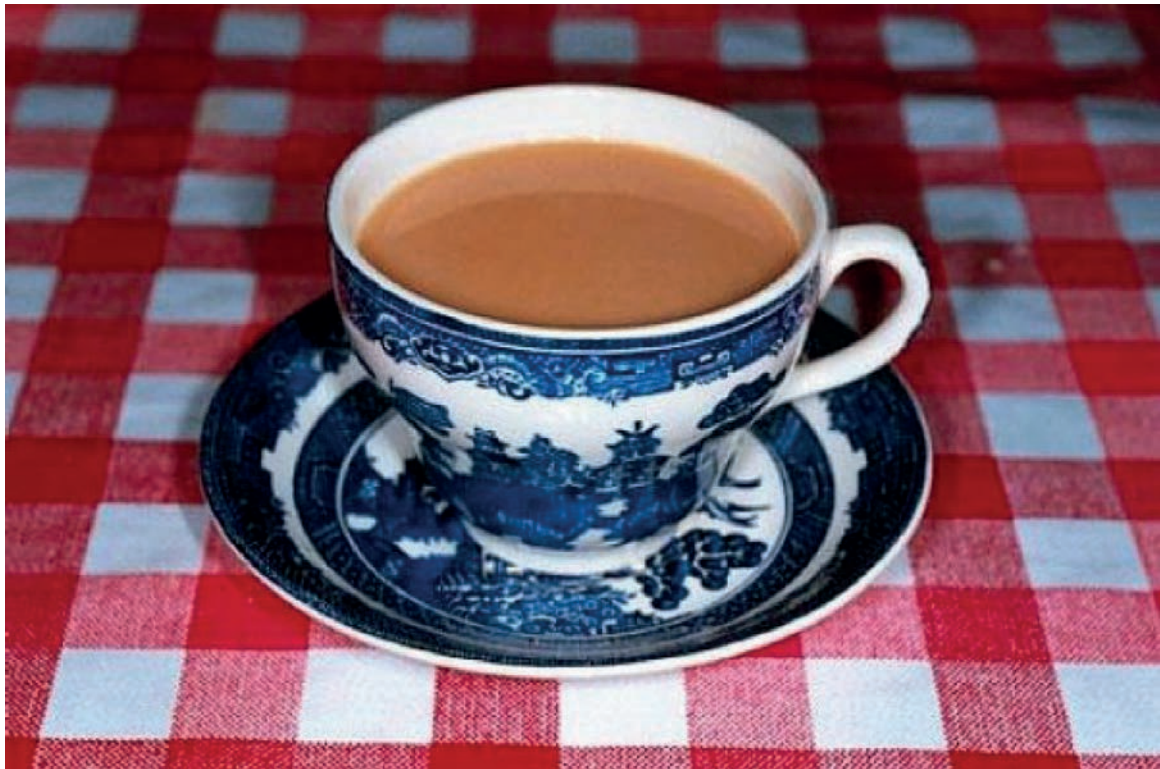
A Cup of Tea Martin Parr photograph

Context can change how a photograph is perceived. Pictures apparently taken for one purpose can have a different interpretation when put into a different context. How can an apparently simple snapshot of a cup of tea on a gingham table cloth be an important 'Art' photograph? Martin Parr set out to gently provoke the accepted idea of 'classic' photography with this image. Richard Prince, Ed Ruscha, Sherrie Levine, Cindy Sherman and Andy Warhol have also explored similar themes of context and appropriation.