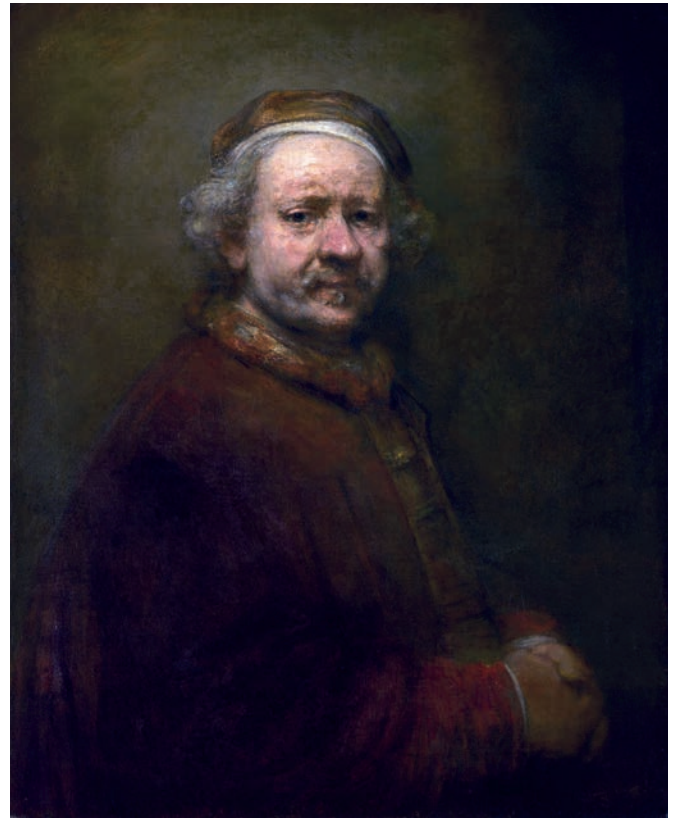
Self-portrait at the age of 63 Rembrandt van Rijn painting