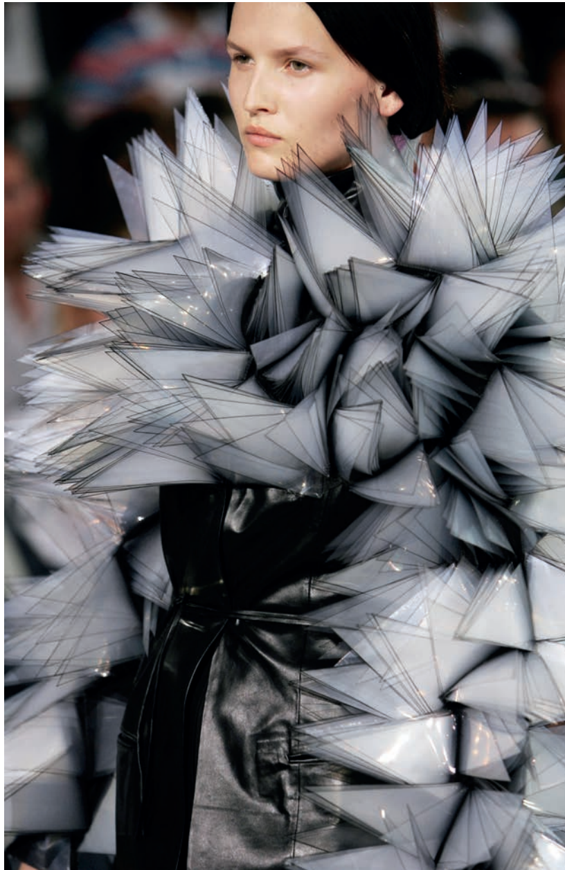
DBKDPW Iris van Herpen fashion design

Some fashion designers distort and change the shape of the human figure, whereas others rely on following its form to give their fabrics and prints vigour. Trends of the day exert huge influence on designs. Victorian high fashion, which featured crinolines, bustles and corsets made from whalebone and wire, fundamentally changed the shape of the figure. Contemporary fashion designer Iris van Herpen uses cutting edge technology such as 3D printing to create structures from various materials in order to transform the body.