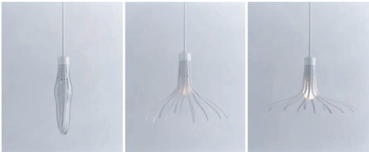
Hanabi Light Nendo design

Frank Tjepkema's Do Break Vase can be transformed into a unique object by being deliberately broken by the user. It remains whole and functional due to a silicone underlayer binding the broken ceramic form.