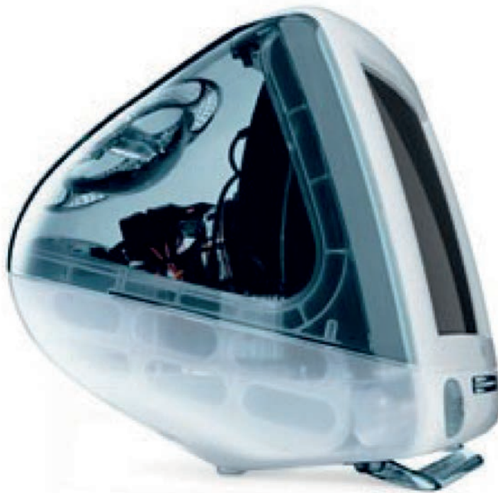
Candy iMac computer

The original 'beige box', whose identity spoke of being a 'helpful friend' rather than a forbidding technological device, then became the desirable and fun Candy iMac. This has more recently morphed into the 'cool chic' of the minimalist but intuitive 'i' series: iPad, iPod, iPhone. Dieter Rams, who inspired Apple's designer Jonathan Ive, said, 'Good design is like an English butler', implying discretion, instinctive understanding of the consumer's needs, and good taste.