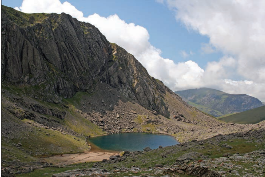
Figure 3: Clogwyn Du'r Arddu, Snowdonia National Park, North Wales

3. (a) Use Figure 3 to describe two distinctive landforms of this glacial landscape. [5]