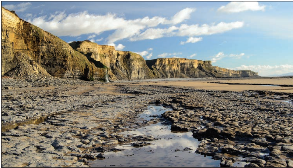
Figure 1: Coastal landscape at Llantwit Major, South Wales

Answer questions 1 and 2 if this is your chosen landscape.