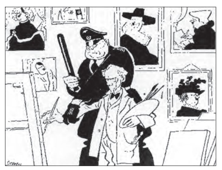
[A satirical cartoon from a Czechoslovakian magazine. It shows the Nazification of art inside Germany (1938)]